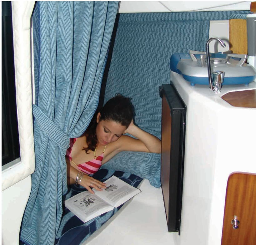
Easy access to aft cabin