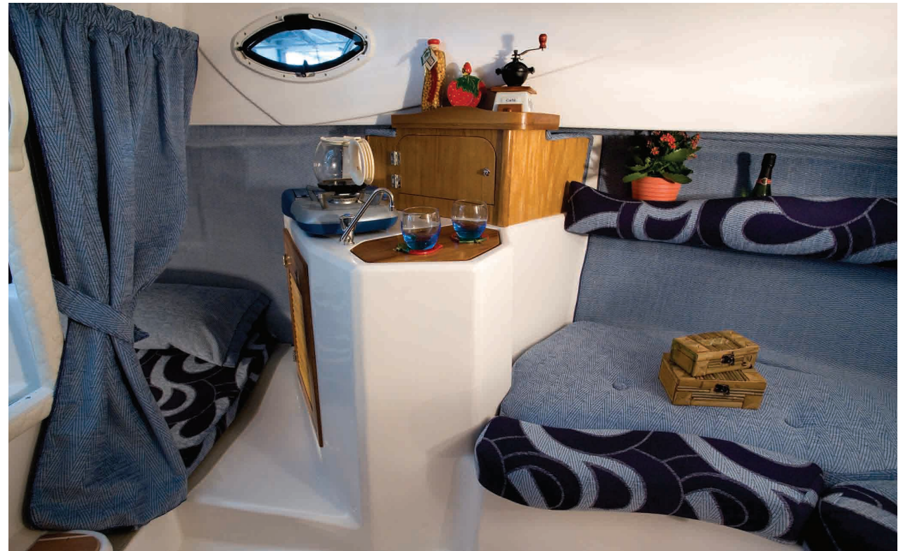
Insulated cabin, easy clean surfaces, teak floor