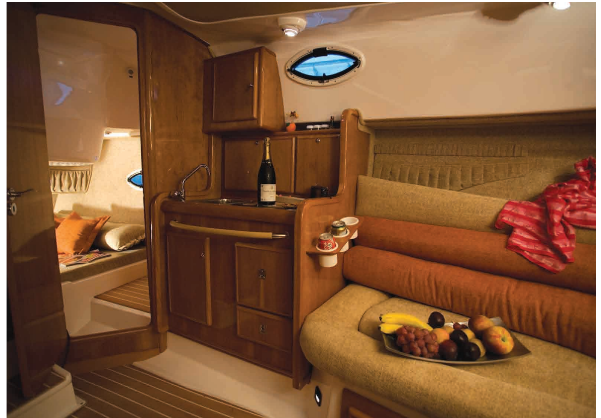
Privacy door to aft cabin