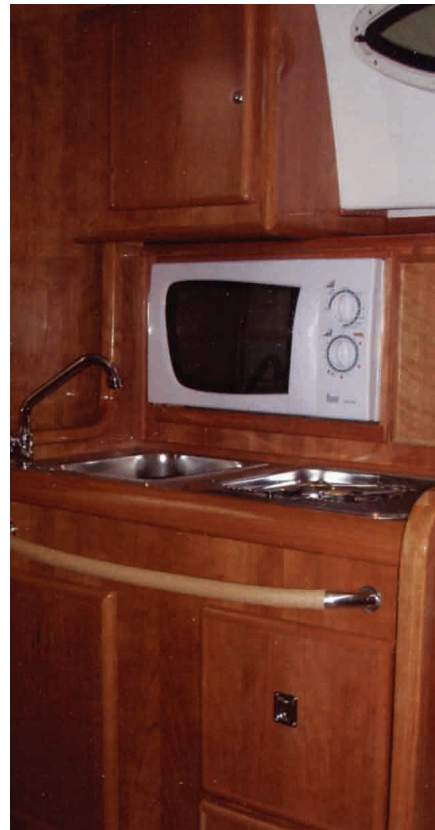
Loads of galley storage space