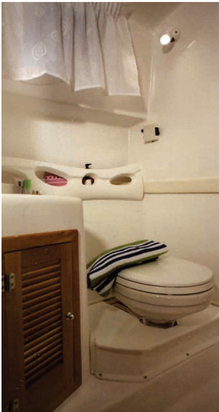
Electric flush toilet